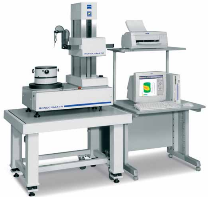
Rondcom 47 with manual rotary table